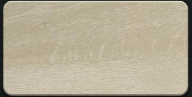
Pale Ivory Oak