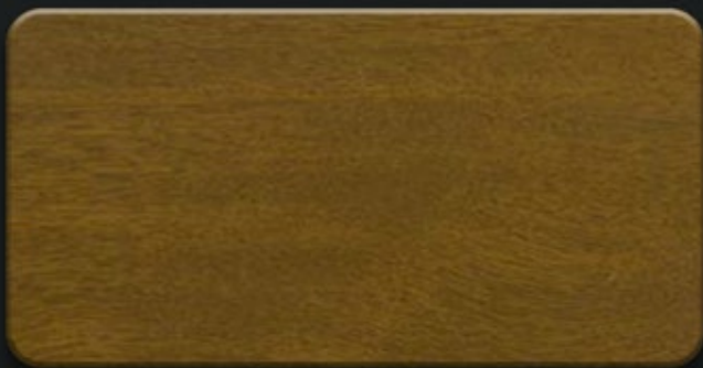
Golden Oak Light