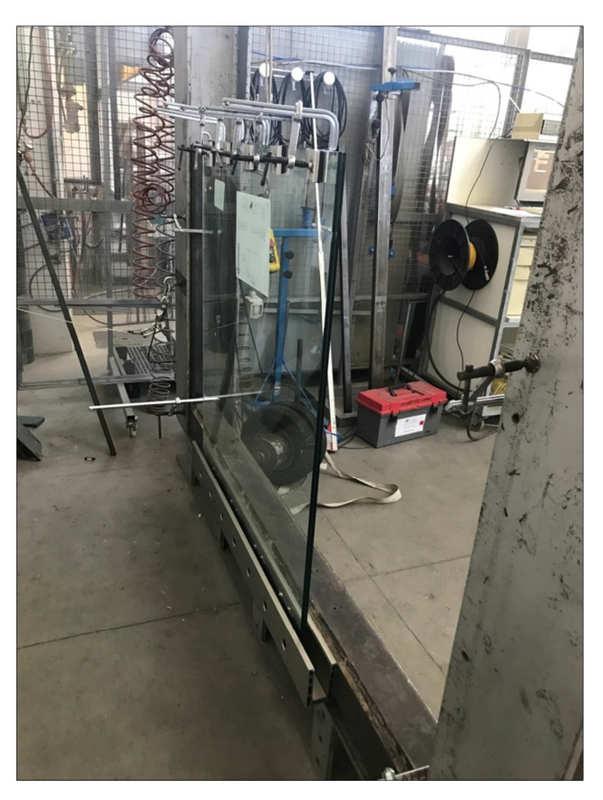
Photographs of the Item