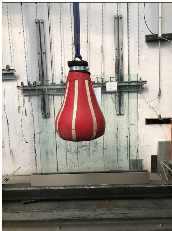
Photograph of the item after impact on the center of the glazing with dynamic load according to standard UNI 10807:1999