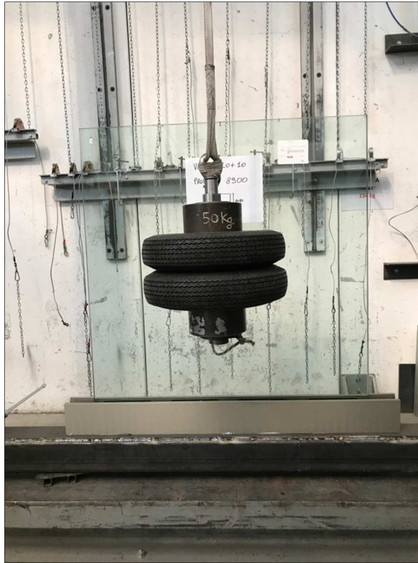
Photograph of the item after impact on the center of the glazing with dynamic load according to standard UNI EN 14019:2016