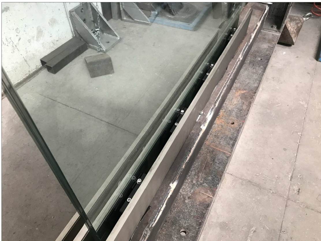
Photographs of the Item