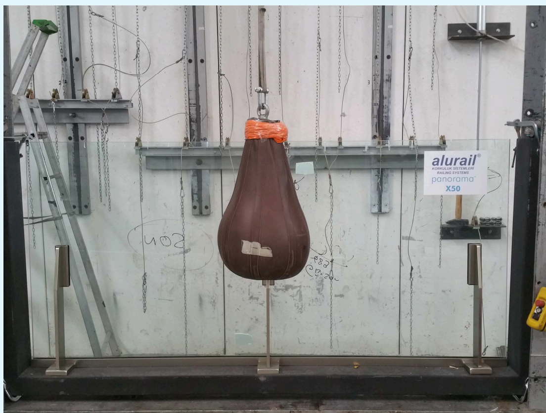
Photograph of the sample after the impact.