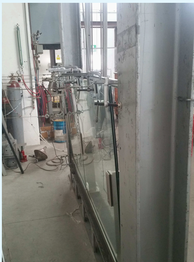
Photograph of the sample subjected to horizontal linear static loading.