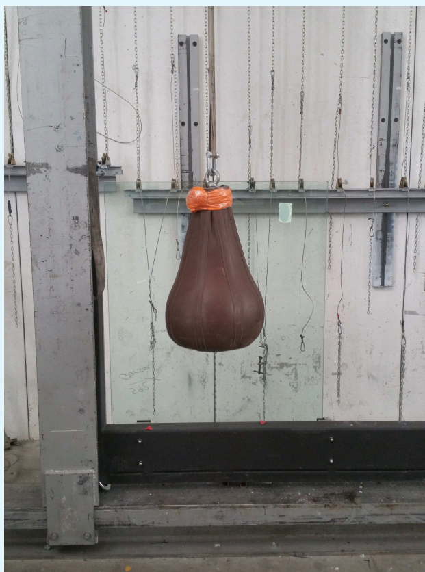
Photograph of the sample after the impact.