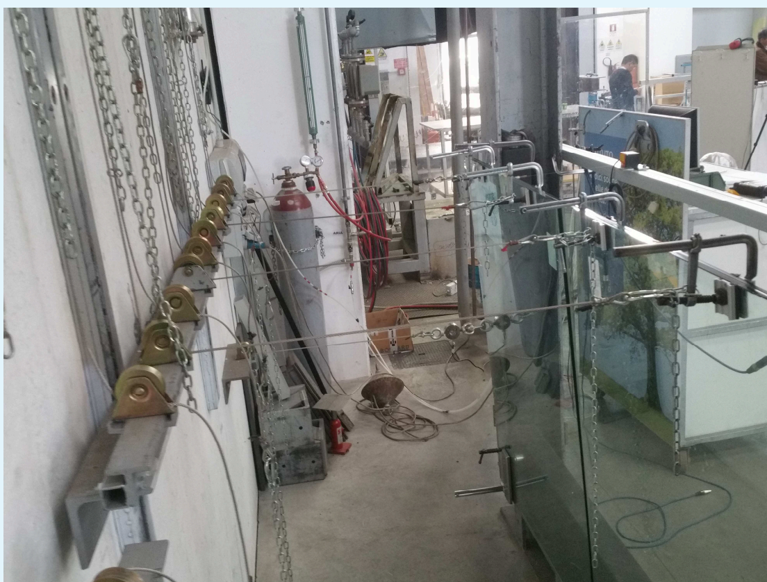
Photograph of the sample subjected to horizontal linear static loading.