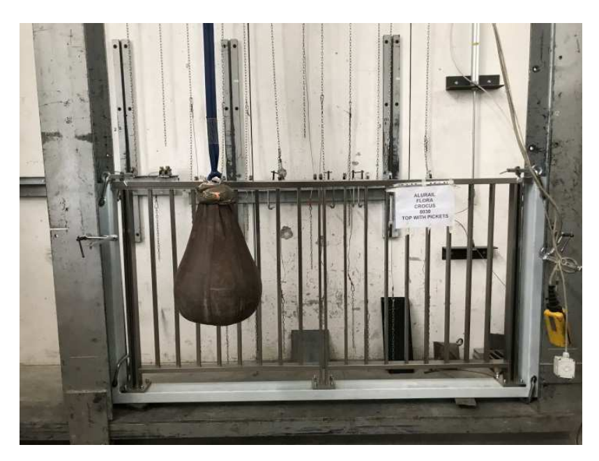
Item photographs after the impact

No sample performance loss compared to design specifications was witnessed.